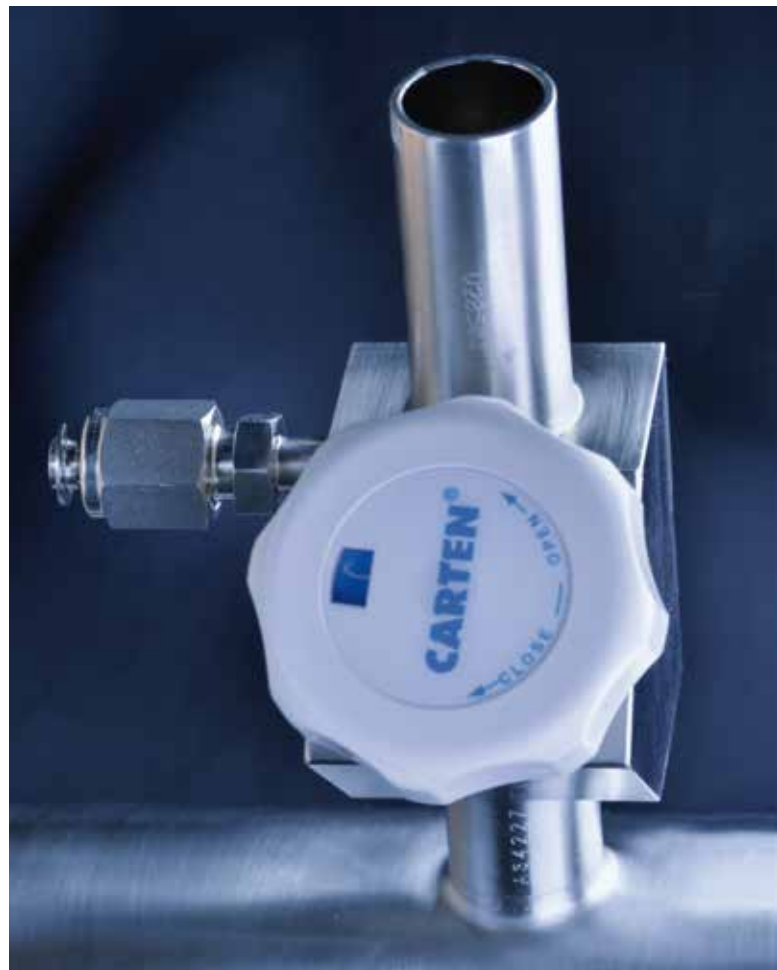
Spool with SPDS1000 valve (straight through)