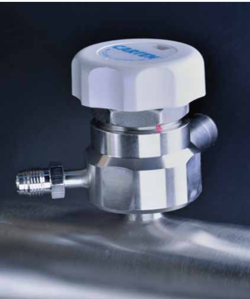
Spool with SPDS755 valve (bottom inlet)